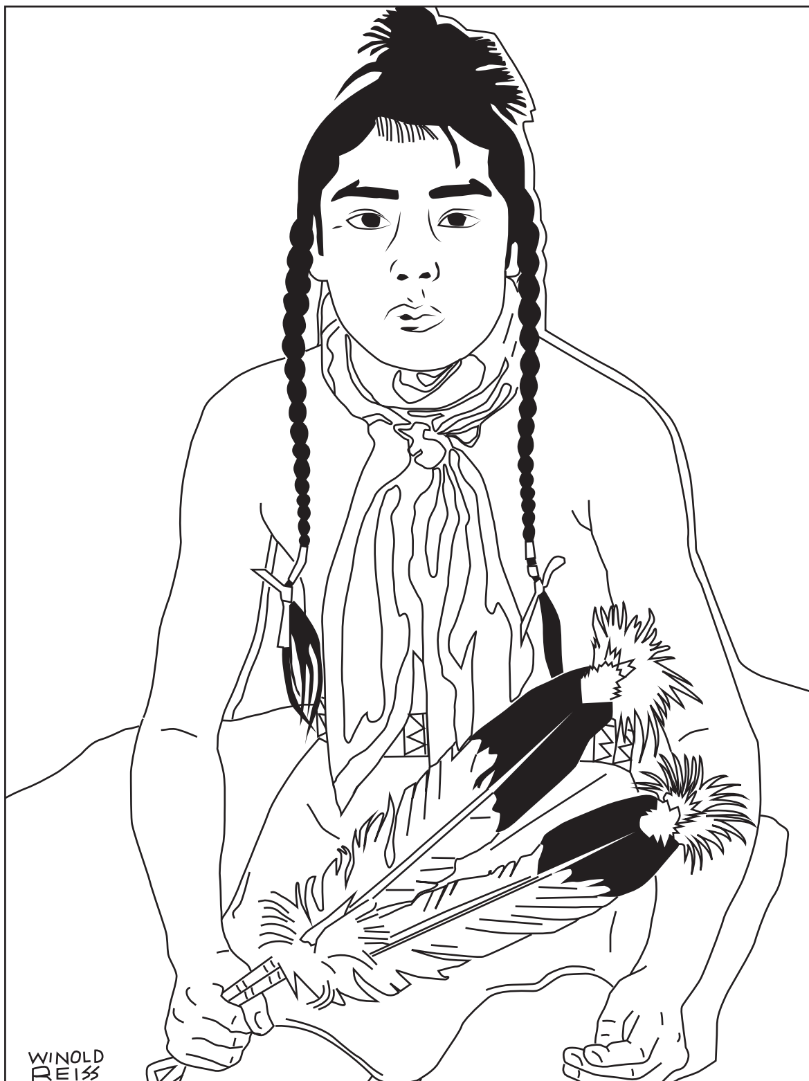
Winold Reiss, Little Boy, Blackfoot Indian , circa 1920s. Pastel on paper, approximately 30 x 22 in. El Paso Museum of Art, Gift of the El Paso Art Museum Association Members Guild, 1983.10.1.