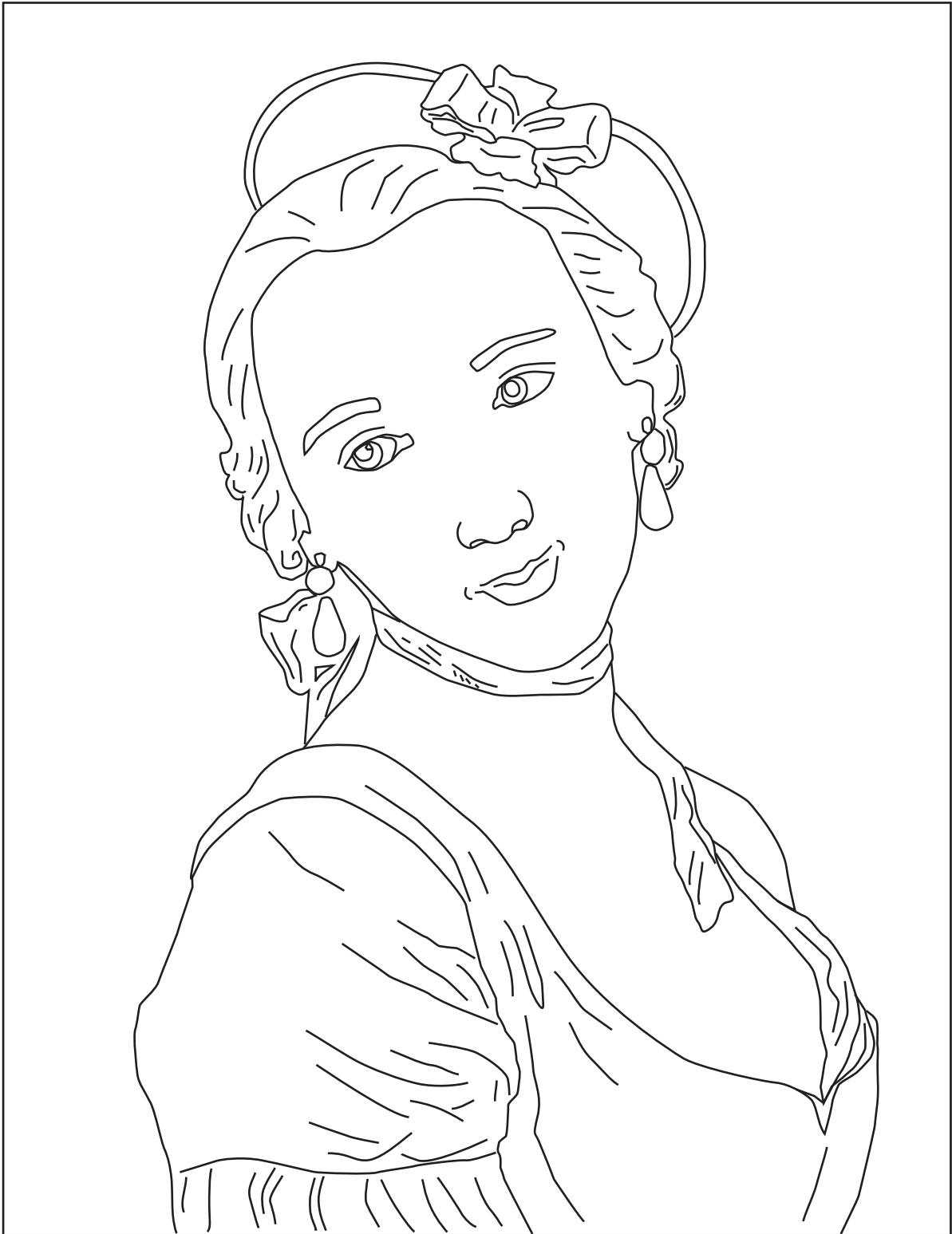
Pietro Antonio Rotari, A Girl with a Red Dress , 1756–62. Oil on canvas, 17 ¼ x 13 ¼ in. El Paso Museum of Art, Gift of the Samuel H. Kress Foundation, 1961.1.45.